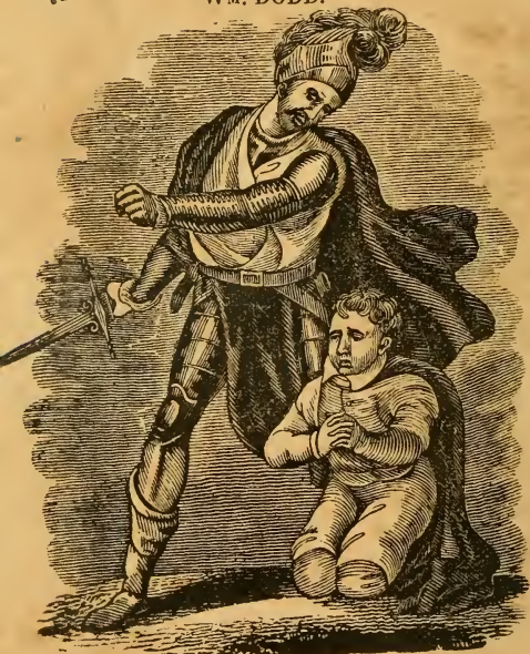
CLIFFORD AND RUTLAND.